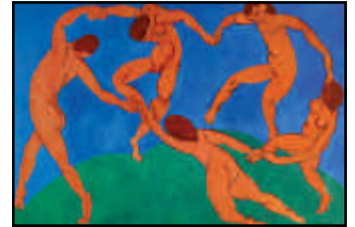
The Dance by Henri Matisse

Art in London on Thursday 13 March at 11.00 looks at works in the ' From Russia ' show at the Royal Academy (26 Jan–18 Apr). Drawn from Russia's principal collections, it includes works by Renoir, Gauguin, Matisse and Kandinsky. Russia cancelled this exhibition before Christmas because of concerns that its paintings might be seized in London. Britain rushed through laws to guarantee against the seizure of foreign state-owned assets in this country and the exhibition was given the go-ahead.